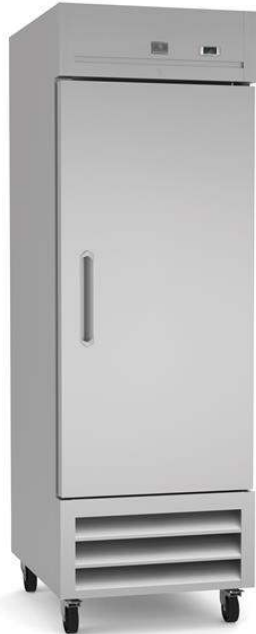
738244 (KCHRI27R1DFE) 1-Door Full Height Freezer 27 " Long